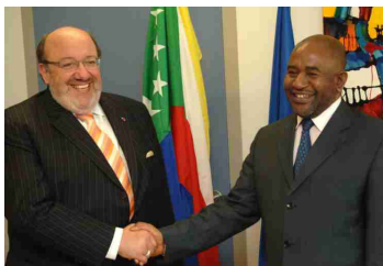
Louis Michel, Member of the EC in charge of Development and Humanitarian Aid, receives Azali Assoumani, President of the Comoros (10/05/2006)