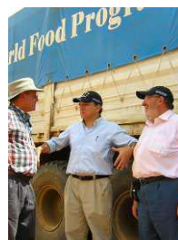
Pres Barroso and Com Louis Michel at the distribution center of the World Food Programme in El Fasher, Darfur, Sudan (01/10/2006)

The European Commission has allocated a further €40 million for life-saving humanitarian assistance to the victims of the Darfur crisis in Sudan. The funding includes €26 million in support of the efforts of the World Food Programme to meet growing nutritional needs in the crisis zone. Other activities being financed include protection and the UN humanitarian air services (UNHAS) which provide vital links to otherwise inaccessible areas. This new humanitarian aid builds on previous Commission decisions for the region.