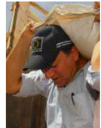
Pres Barroso lending a hand with the relief action