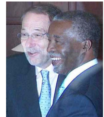
Pres Mbeki & Mr Solana

While paying a fleeting visit to South Africa, Javier Solana, the EU's High Representative for the Common Foreign and Security Policy (CFSP), accompanied by Mr Aldo Ajello (EU Special Representative for the African Great Lakes Region) met with President Thabo Mbeki. The meeting, also attended by Defence Minister Mosiuoa Lekota focused on issues of mutual interest including the United Nations and the African Union, as well as on the Great Lakes region and notably the Democratic Republic of Congo (DRC), and the situation in Dafur, Sudan. Subsequently Mr Solana, and EU Commissioner Louis Michel (Development and Humanitarian Assistance), met with DRC President Joseph Kabila in Kinshasa. This joint visit was aimed at evaluating progress in the transition process of the DRC, of which the EU, alongside the UN, is the principal sponsor.