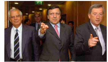
from left to right: Josep Borrell, José Manuel Barroso, Jean-Claude Juncker

See also: Joint Declaration on the results of the French Referendum on European Constitutional Treaty (29/05/2005)